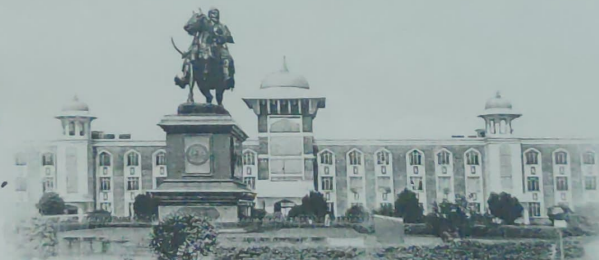
President Board of Sports and Physical Education