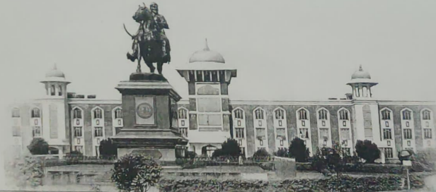
President Board of Sports and Physical Education