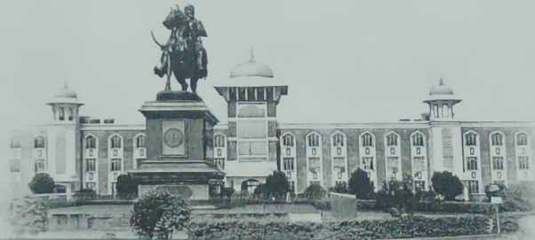
President Board of Sports and Physical Education